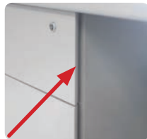
Unique & esthetically superior hidden vertical drawer pulls.