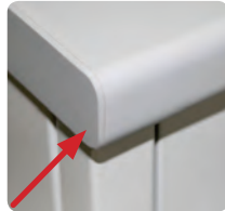
Unique user friendly and safer ergonomic rounded edging.