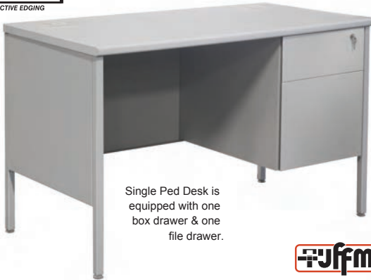
Single Ped Desk is equipped with one box drawer & one file drawer.