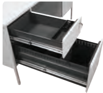
Full extension File drawer, triple tied cradles & high sides.