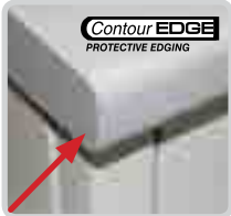
Unique user friendly and safer ergonomic rounded edging.