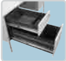
Full extension File drawer, triple tied cradles & high sides.