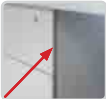
Unique & esthetically superior hidden vertical drawer pulls.